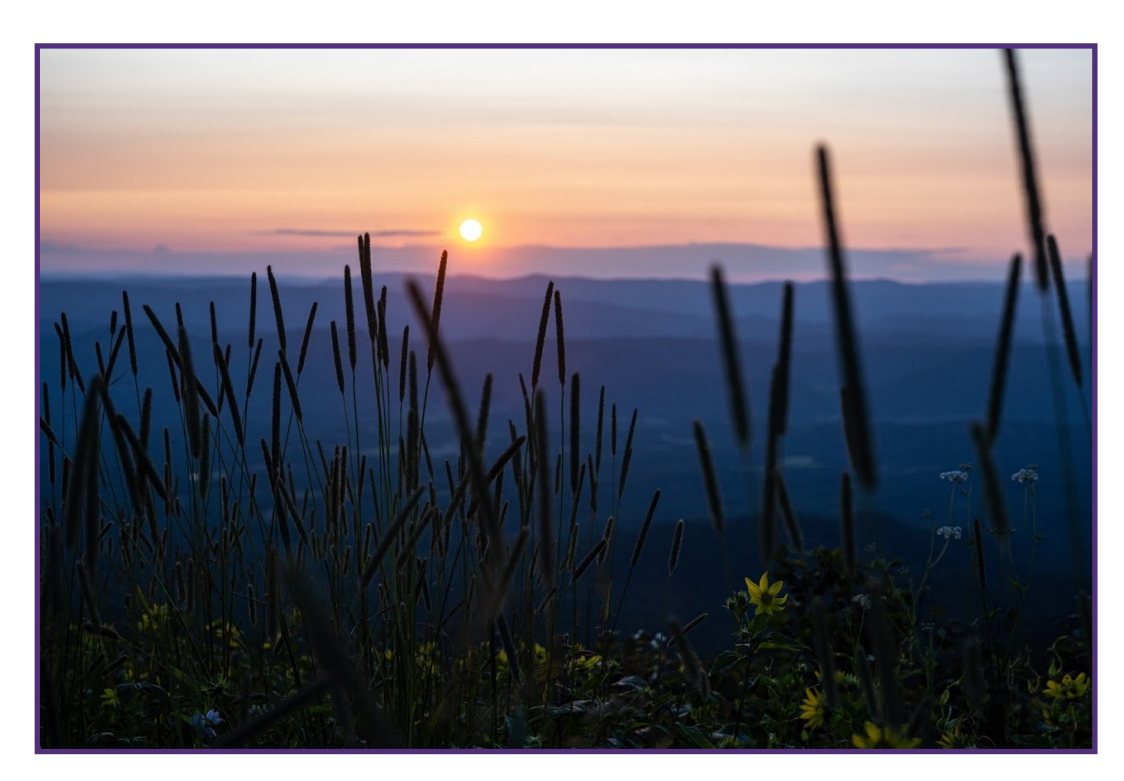
"As in all successful ventures, the foundation of a good retirement is planning."