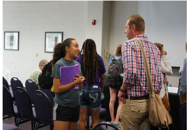
Conversations following the White Supremacy, Confederate Monuments, and Free Speech in Charlottesville Flashpoint event.

The CFI engages with the local, national, and global communities on issues such as inclusive excellence , the changing professoriate, and diverse forms of scholarship. Notable is the framing of access, inclusion, diversity, and social justice initiatives that both center and wrap around our work. We believe richness of difference is integral to the cultivation of high-quality academic programs. Further, inclusion, access, and equity initiatives must coexist at multiple levels in order to enhance faculty's diversity capacities in teaching, scholarly creation, career planning, and leadership.