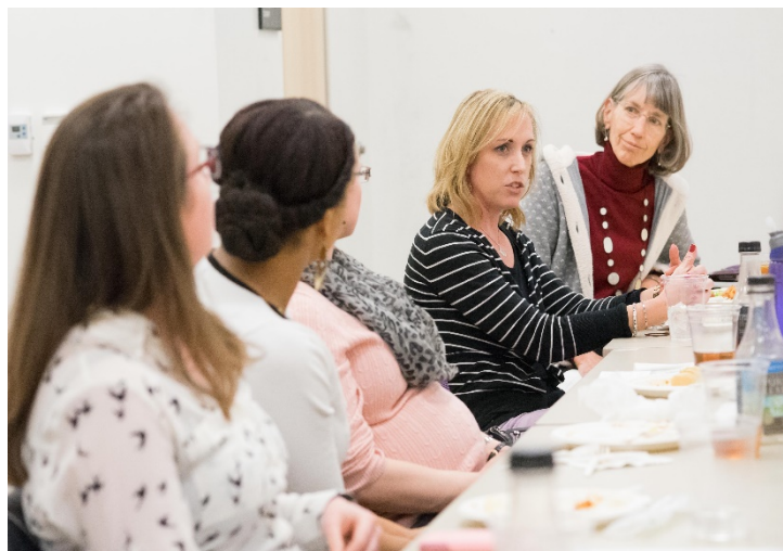
Peer discussion during the Community Engagement Networking Lunch