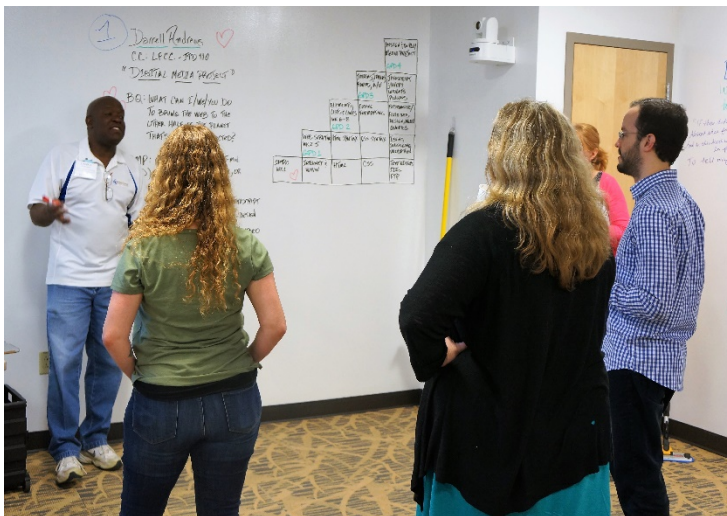
Small group presentations during jmUDESIGN

Integral to living the mission and realizing the vision of the Center for Faculty Innovation is our commitment to cultivating a sense of belonging for each member of the JMU faculty community. This entails an attention not only to the content of our programs, services, and advocacy efforts but also to the means, methods, and places within which professional development opportunities are offered.