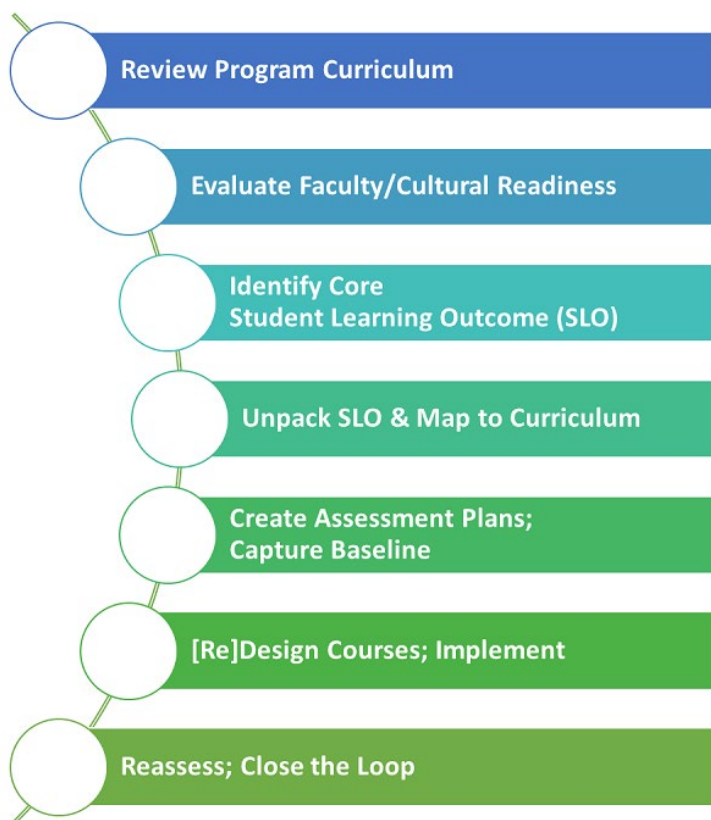
Learning Improvement by Design (LID) process