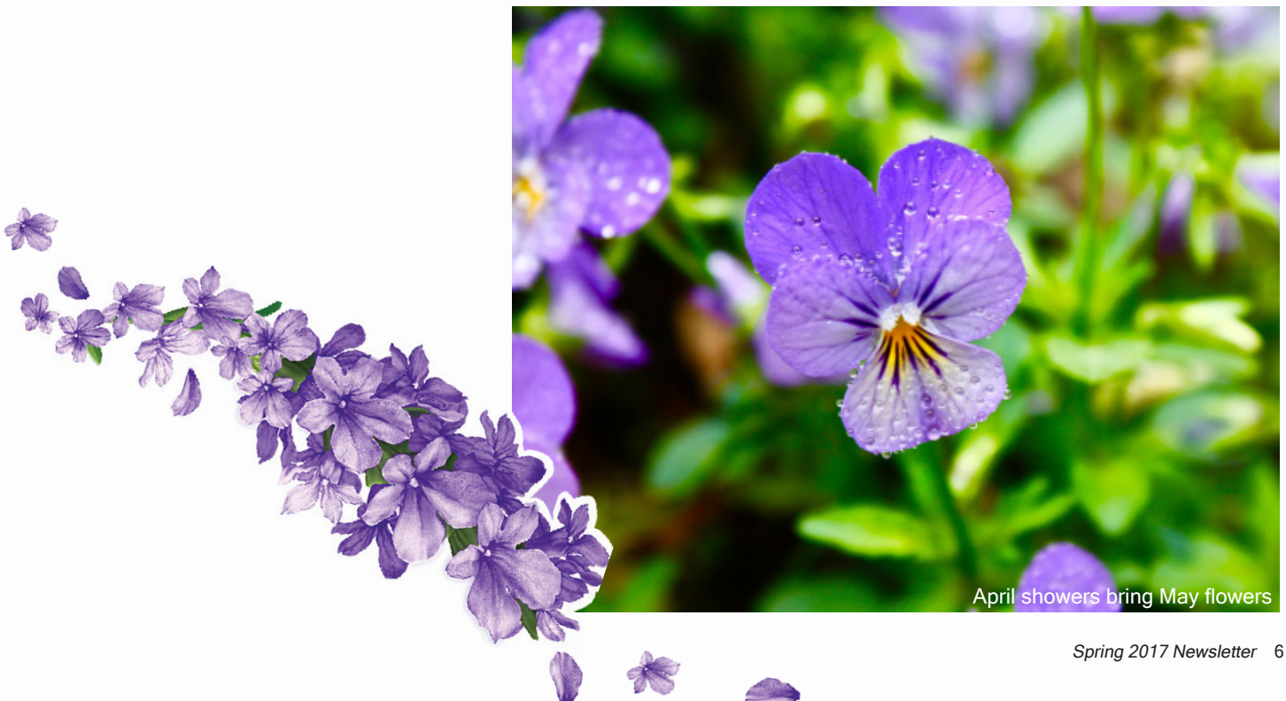
April showers bring May flowers