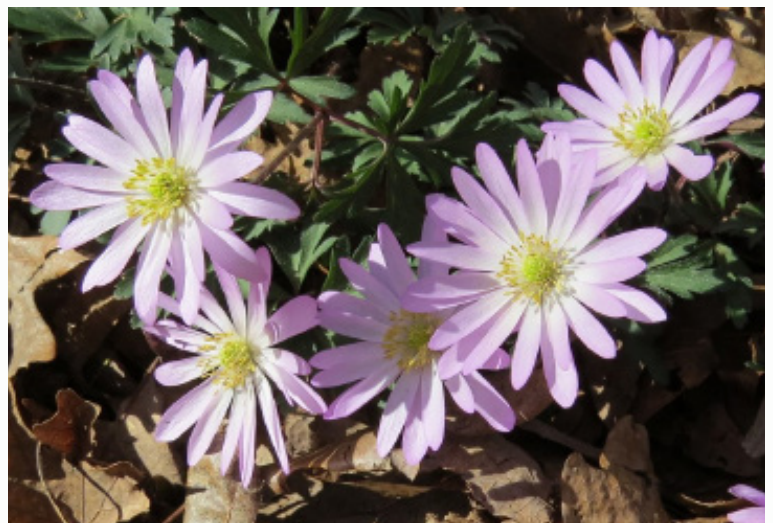
Flowers bloom during springtime in the arboretum