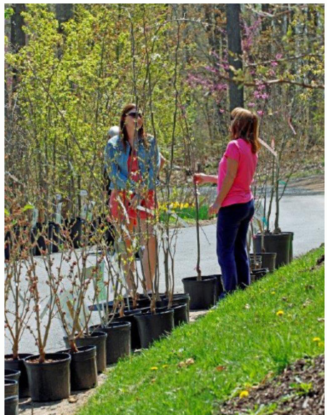
Stop by the arboretum on April 21-22 for our Arbor Day Trees and Native Plant Sale!

See arboretum woodland flowers and learn about Virginia native trees and see the Century Trees found at the arboretum. Then after seeing where these grow naturally, learn about growing native shrubs and trees and their particular environmental needs to be able to plan tree and shrub purchases for any home or business gardens at the sale coming in May.