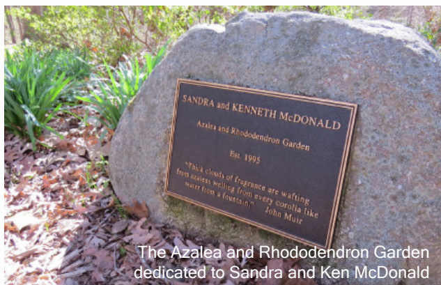
The Azalea and Rhododendron Garden dedicated to Sandra and Ken McDonald

“... dedicated volunteers continue to give of their time and their expertise ... and to make gifts to fund and care for these rhododendrons.”